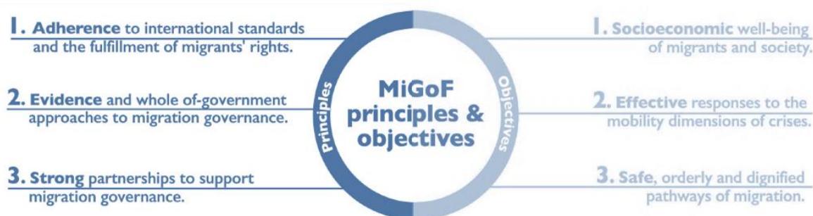
Figure 1. Principles and objectives of the Migration Governance Framework

The three principles propose the necessary conditions for migration to be well-managed by creating a more effective environment for maximized results for migration to be beneficial to all. These represent the means through which a State can ensure that the systemic requirements for good migration governance are in place.